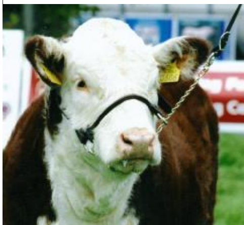
West Cork Club (West Cork)